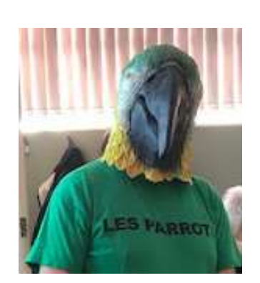
Fig 2. A third Parrot