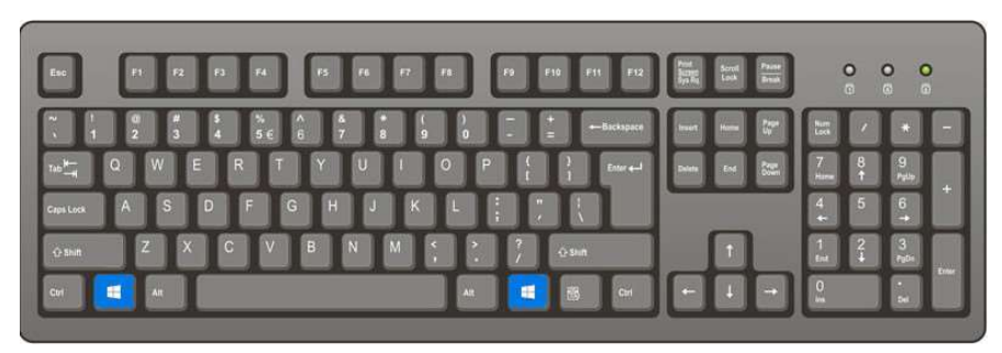
Figure 1: The windows keyboard