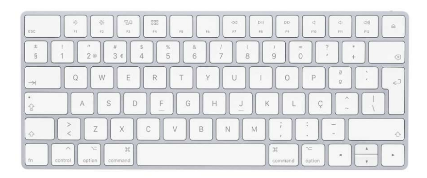
Figure 2: The Mac Keyboard